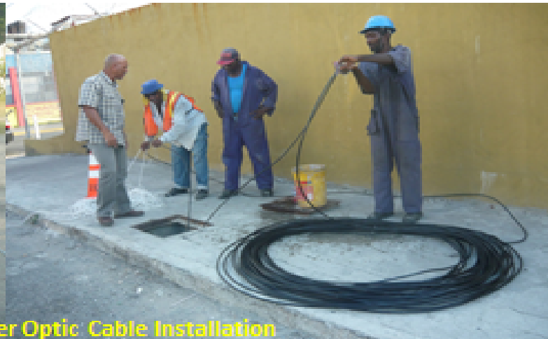
Kingston – Underground Fiber Optic Cable Installation