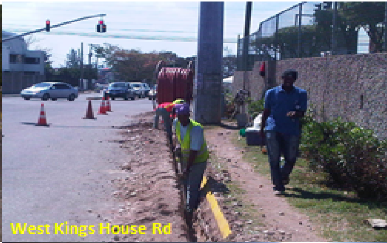
West Kings House Rd