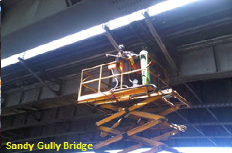
Sandy Gully Bridge